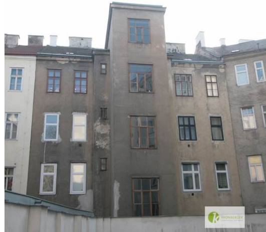
Pilot Project Eberl Alley: First reconstruction in Vienna in passive house standard

Since no building of the promoterism era has ever been reconstructed as passive house all over Austria, the project commands a high demonstration value. The reconstruction of the façade to passive house quality and the installation of passive house windows and doors as well as the high quality insulation of the ceiling of the lower floor stand out as major actions undertaken. Moreover, an additional living room was created in the course of expanding an attic floor. The reconstruction contains the renewal of the complete building equipment and appliances and electro-technical equipment including conversion to energy-efficient lighting system. A groundwater thermal pump and a photovoltaic facility were installed for the supply of heating.