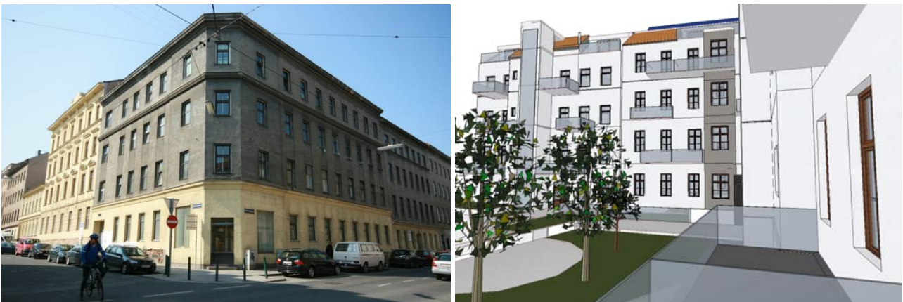
Ensemble David's Corner, Yard view in accordance with planned reconstruction

The ensemble of three buildings of the promoterism era in Vienna Favoriten forms the corner of a typical perimeter block development. But for a few exceptions, the 34 residential units were still in their original room-kitchen configuration. Altogether, the three buildings including the 5 business premises on the ground floor have a utility area of 2,350 m 2 . Two objects have a cleared façade, one object, a fully preserved segmented façade. The objects were in a state that strongly requires reconstruction (moisture, leaking roof, leaking windows etc.). With warehouse halls covering most of its area, the yard was in a desolate situation. The thermal heat requirement of the 3 objects before reconstruction was about 121 kWh/m 2 a, heat supply was realized through gas converters, while hot water preparation was realized through electrical storage heater in individual apartments. The buildings are owned by Condominium Immobilien. After a long planning phase, the project is being implemented by Bluewaters, the real estate trustee chancery Dirnbacher, Treberspurg & Partner Architekten and Imoplan ZT for building equipment and appliances. Completion is scheduled for 2014.