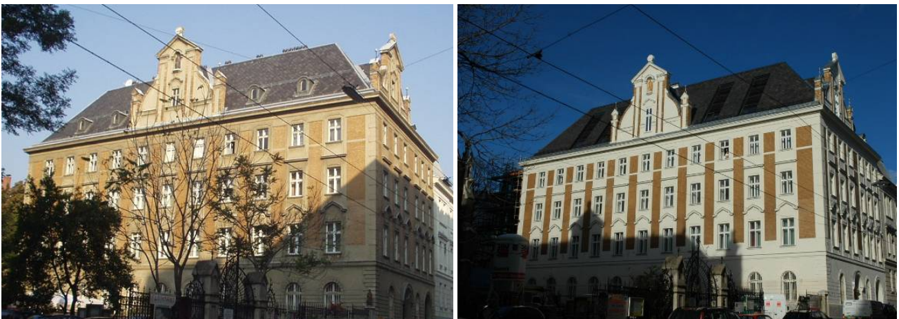
Square and Street view of Kaiser Street before and after reconstruction

In addition to the thermal reconstruction of the roof truss, yard façade and fireproof walls and the application of a central ventilation system with heat recovery and particularly the installation of interior insulation and complementation of the box-type windows to be sustained by applying inward lying wooden window frames that are suitable for passive houses, can be highlighted as innovative reconstruction measures.