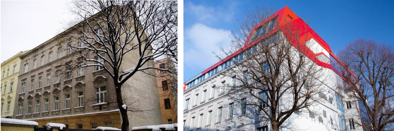
Object Wißgrill Alley before and after comprehensive reconstruction and attic expansion

The first demonstration project was successfully completed already at the start of 2011. It is a comprehensive reconstruction including the expansion of the attic that was implemented by Ulreich Bauträger as property owner and building developer along with Gassner & Partner as General Contractor for planning and design.