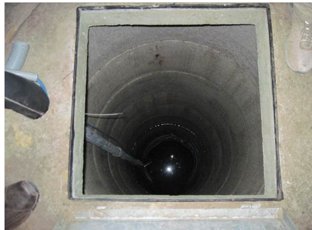
Eberl Alley: Groundwater thermal pump and extraction well

A reduction of thermal heat needs by more than 90% was attained through the measures adopted. The energy balance sheets of the building show that the designated reconstruction measures